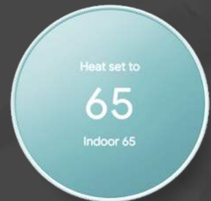
Nest WiFi Thermostat